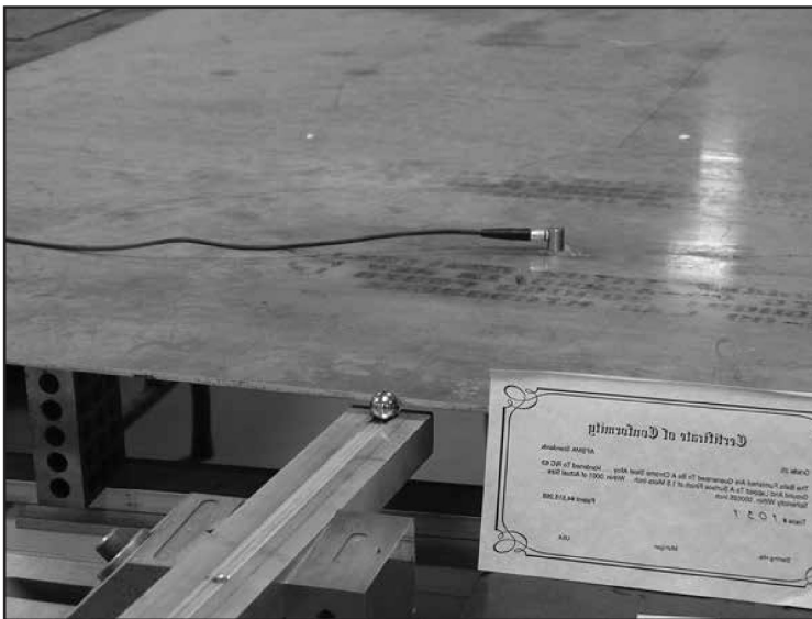
FIGURE 1. ROLLING BALL IMPACT CALIBRATION SETUP

which is the formula for computing energy in the MAE signal, where V is the voltage in volts (V) and Z is the input impedance in ohms ( \Omega ). A rolling ball impact setup shall be used to create an acoustical impulse in an aluminum plate. The measured energy in the wave shall be used to scale the fiber break energy. This scaling is illustrated later on.